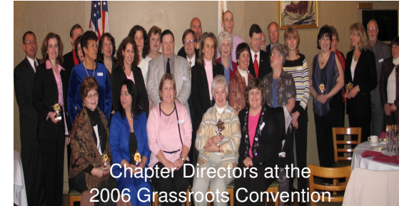
Chapter Directors at the 2006 Grassroots Convention

there is a chapter in your city. If there is, email the chapter director and volunteer. Or if there is a local chapter stamp on the back of this brochure, give the chapter director a call or send an email.